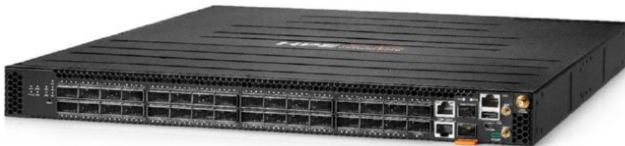
HPE Aruba Networking CX 8325P

The CX 8325 switch series is designed with Quality of Service (QoS) features, full-featured Layer 2 and Layer 3, and advanced EVPN-VXLAN features. For enhanced visibility and troubleshooting, the HPE Aruba Networking Network Analytics Engine (NAE) automatically interrogates and analyzes events that can impact a network's health. Advanced telemetry and automation provide the ability to easily identify and troubleshoot network, system, application, and security related issues easily, using python agents, CLI-based agents and REST APIs.